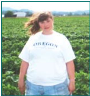
Me at 300 pounds

I am a motivational life coach specializing in weight loss. I have created a 16 week program from my own 110 pound weight loss journey. My top weight was 300 pounds! I was determined to not spend the rest of my life this way. I tried every program, diet, and gimmick out there. When I finally found the answer, I realized why I hadn't found the answer...there was no one answer! I had tried one thing, or the other. So I put them all together, at the same time. It was an amazing experience and it worked!